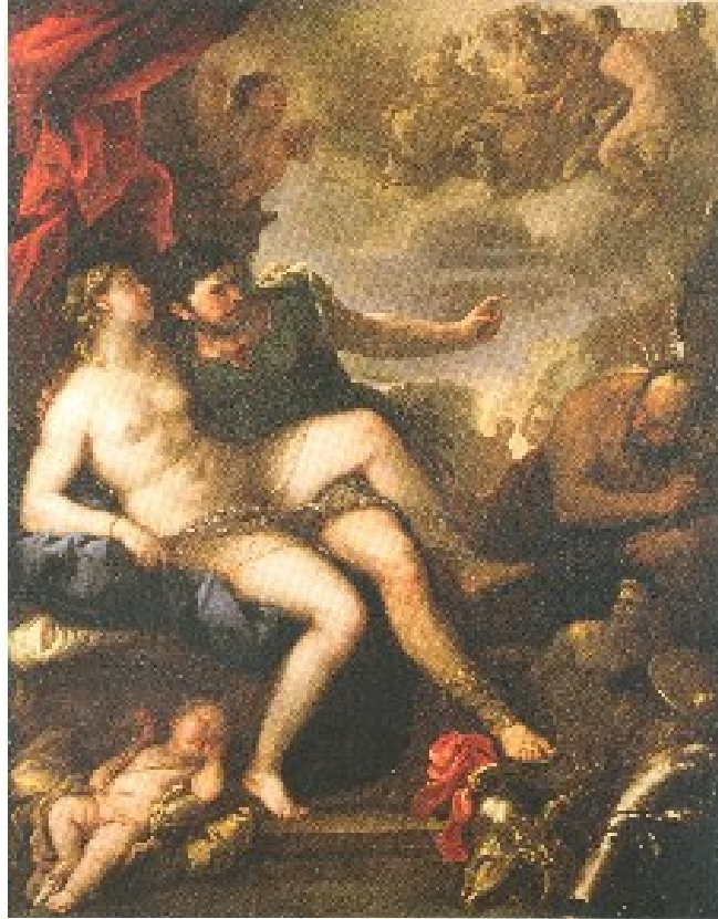
Figure 1 Painting by Luca Giordano